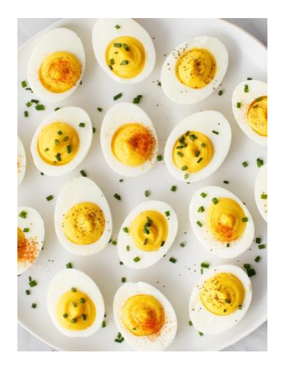
Gourmet Deviled Eggs