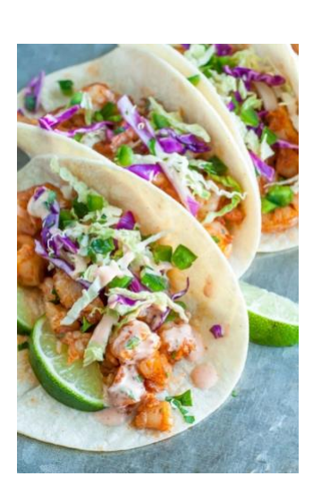
Rock Shrimp Tacos