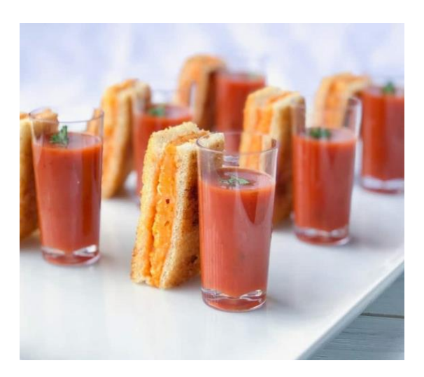
Grilled Cheese & Tomato Soup Shooters ///